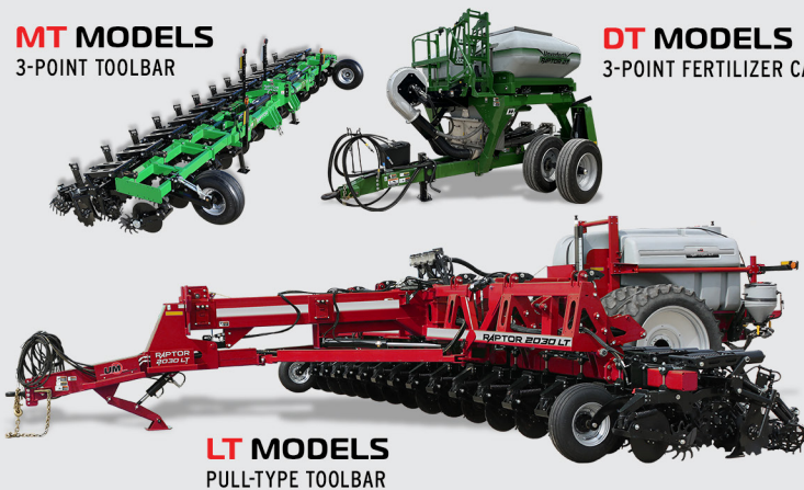
LT MODELS PULL-TYPE TOOLBAR